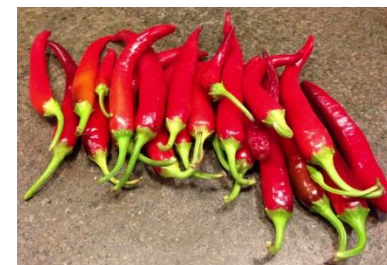
Maule's Red Hot