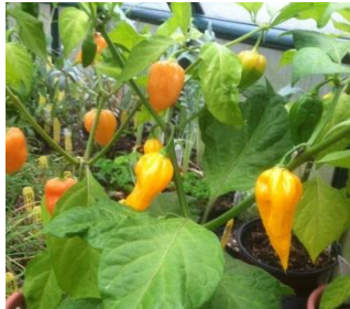
Trinidad Moruga Scorpion