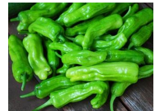
Golden Greek Pepperoncini