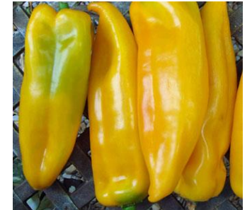
Corno di Toro Gallo*