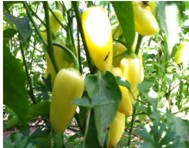
Wen's Yellow Hot